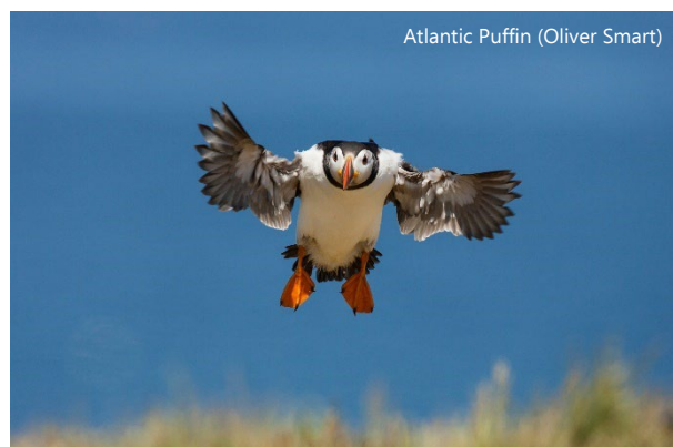
Atlantic Puffin (Oliver Smart)

Another option, if the weather is looking kind, is to join a morning sailing around Coquet Island from Amble. Although it is not possible to land only the island itself, the hour-long boat trip can provide wonderful views of the large colonies of Puffins and Sandwich, Arctic and