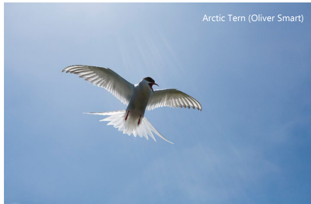
Arctic Tern (Oliver Smart)

On both days we will spend time on each of Staple Island and Inner Farne, where we will enjoy excellent views and outstanding photographic opportunities of the many thousands of Puffins, Guillemots, Shags,