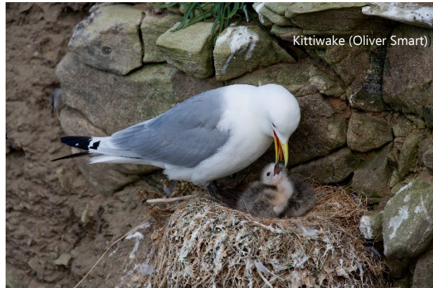
Kittiwake (Oliver Smart)

During our four full days on and around the coast, two will be spent enjoying full-day visits to the Farne Islands, which will provide us with the opportunity to photograph a tantalising array of seabirds at close range, from the exquisite but feisty Arctic Terns bringing Sandeels to their chicks, to Guillemots, Razorbills, Kittiwakes and, of course, the ever-photogenic Puffins. A day on the Farne Islands is a truly magical experience and as well as the