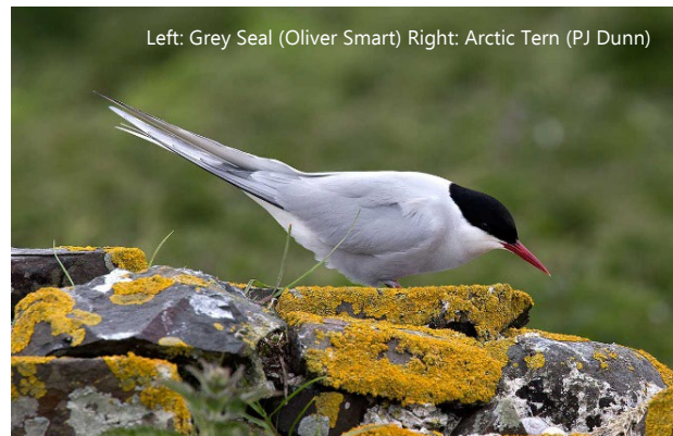
Left: Grey Seal Right: Arctic Tern

During two of the next three days we will enjoy full-day visits to the Farne Islands by boat, allowing us close views of the spectacular seabird cliffs from the sea, along with basking Grey Seals. Our embarkation point for a full day touring the islands will be Seahouses and while we wait to board the boat, and on our return, we are likely to be entertained by the antics of Eiders in the harbour. Many of the seaducks here can be very confiding and it will be worth spending a bit of time in Seahouses itself to make the most of the photographic opportunities on offer.