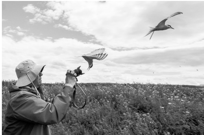
'Is this close enough?' Farne Islands (by Susan Dillon)

We hope for pleasant sunny days but like the rest of Britain, Northumberland is subject to unpredictable weather! We hope for settled warm conditions with little rain, but if a northerly air stream is established it can be much colder and we would always suggest checking the weather forecasts immediately before the holiday and packing accordingly. Regardless of the prevailing conditions it will feel cooler during the sea trips and warmer clothing will be needed for these. Waterproofs are recommended as rain is always possible, and good, waterproof footwear is also recommended. Equally, during the day the islands we are visiting can get hot in the sunshine, so a hat and sun cream are recommended.