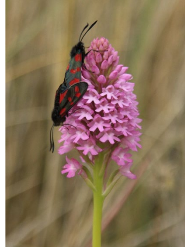
6 Spot Burnet Moths on Orchid, Lindisfarne

During the evenings we will generally plan to eat early and then head out again after dinner in order to make the most of the long, light evenings at this time of year. We will spend time practicing our coastal landscape photography, with nearby Bamburgh Castle, and Dunstanburgh Castle to the south, both options that provide iconic focal points for our evening sessions.