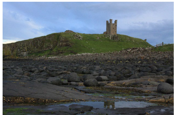
Images from top: Arctic Tern (Alison Steel), Atlantic Puffins (Oliver Smart), Dunstanburgh Castle (Alison Steel).